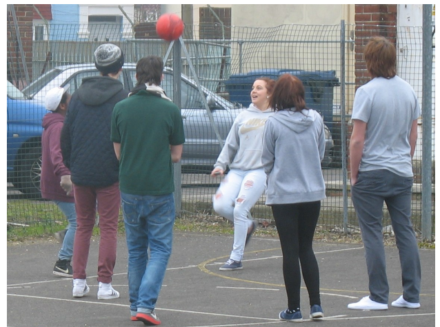
A group pupils make the most of a rare dry day to play football.