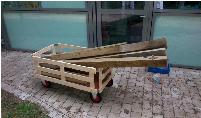
Tyler's Garden Trolley