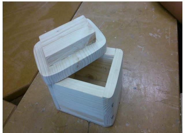
Bonnie Mae's Gift Box